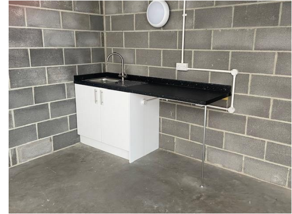
Tea station located on ground floor