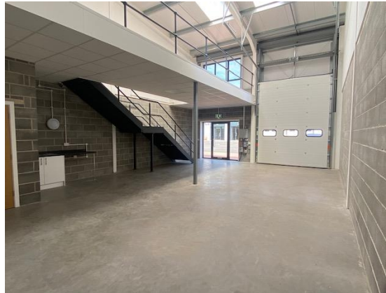
Ground floor space showing loading door and mezzanine floor